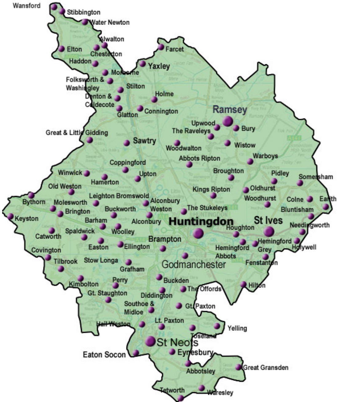
Based on the Ordnance Survey Mapping.